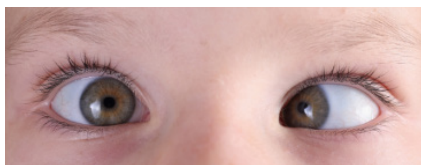
Figure 1 is an inward turn in the Left eye.