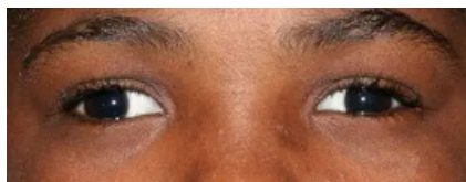
Figure 2 is an outward turn in the Right eye.