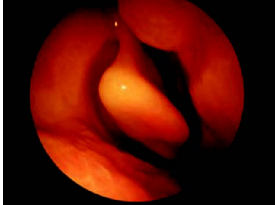
The view inside a 'normal nose'.

Chronic sinusitis is sinusitis that continues for many weeks. Chronic sinusitis may be caused by an acute sinus infection which fails to resolve or as a result of an underlying allergy affecting the lining membranes of the nose and sinuses. Common symptoms include nasal obstruction, headache, nasal discharge, low grade fever, reduced sense of smell, facial discomfort and halitosis.