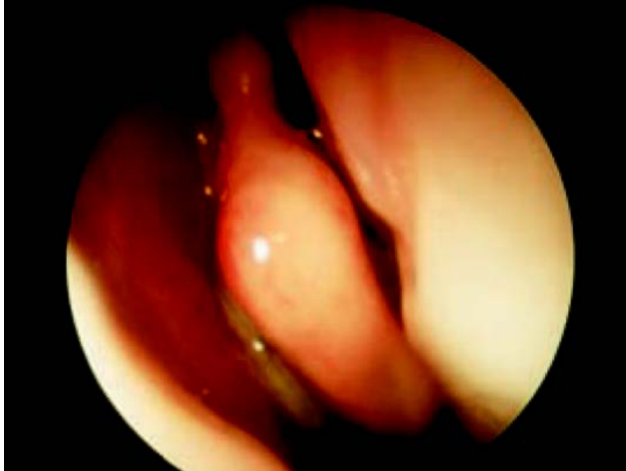
A patient with chronic sinusitis. The thick green mucus associated with a sinus infection can be seen draining into Frontal Sinus the nose.