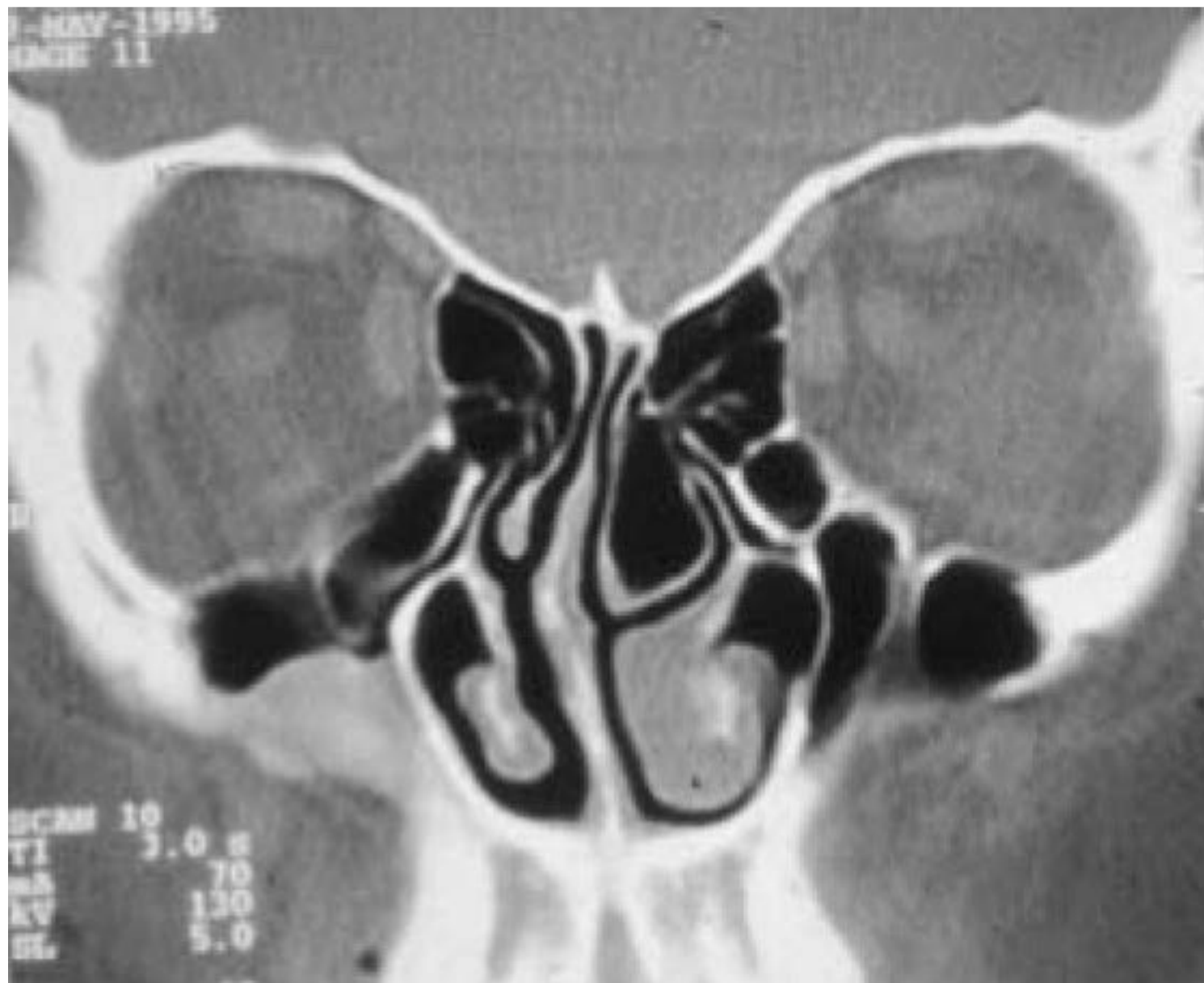
CT scan of normal nose and sinuses.

Occasionally symptoms will persist despite ongoing use of medicines in which case surgery may be necessary. The diagnosis of sinusitis by a specialist will involve the use of a nasal endoscope which the doctor can use to examine the nasal lining and the sinus openings.